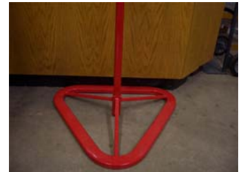
Against A Table