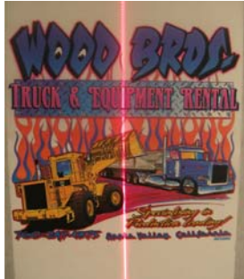
Center Graphic Design

Tape down a blank piece of pellow to your pallet and run a test print to determine where your graphic is going to be printed.