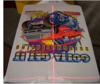
Center Graphic Design