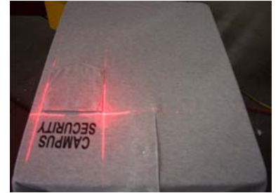
Left Chest Design

All images and text on this website are copyrighted by Laser Targeting Systems unless owned by another party.