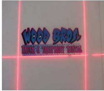
Left Chest Design