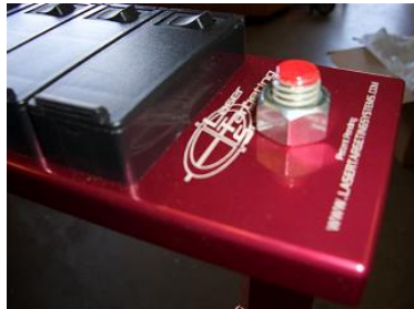
Tighten the Top Nut to Secure the Control Panel