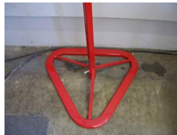
Stand Against A Wall

The Triangle Base is designed to allow you to get the Floor Stand as close as possible to a wall or table while still having a stable base to set your alignment system up on.